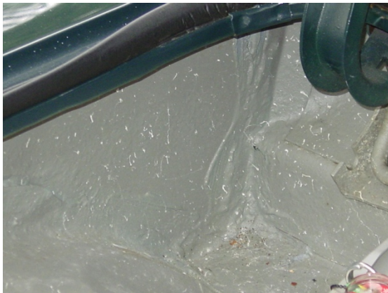
Right Rear Trunk Corner – late '63-early '64

09C: Trunk Vents – the vents in the right and left rear corners of the trunk were changed to stamped louvered vents. The exact date of the changeover occurred early in the 1964 model year – all cars built before 09C have the earlier style.