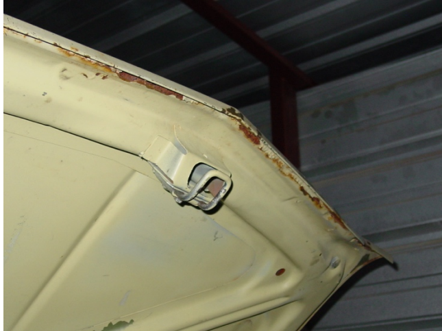
09C Trunk Lid with push-in letters

12B? Trunk Lid Letters: The C O R V A I R letters on the trunk lid were initially of the push-in style (same as on the Deck lid), but due to issues with water getting under them and causing rust, were converted to screw-in style sometime around mid-December of 1963. We have found some cars with later build dates (up to 02D) with the push-in style, but no cars earlier than 12B with the screw-in style. It's thought that the changeover probably occurred around 12B but excess inventory was used up on a few later builds.