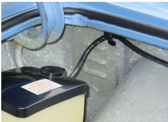
Left Rear Trunk Corner – 1961-early 1964