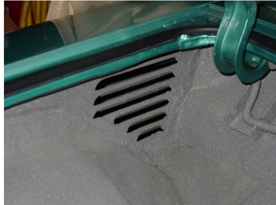
Right Rear Trunk Corner – 09C 1964