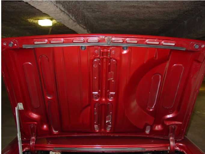
01C Deck Lid with 8 drain holes and shorter weatherstrip

02A? Deck Lid Vents and Weatherstrip: Modification made to the rear under end of the Deck Lid to close off 6 of the 8 drainage holes and elongate the rear weatherstrip to reduce the likelihood of tailpipe emissions being drawn back into the engine compartment. The earliest car I've seen with this change has body code 02A, with some as late as 04A still with the original style.