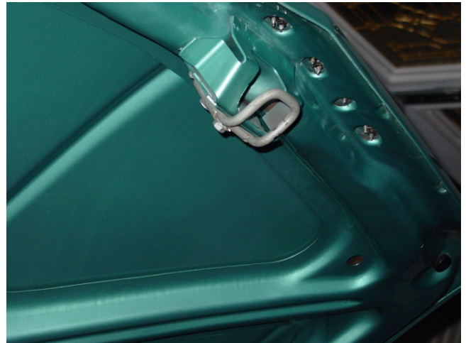
04A Trunk lid with screw-in letters

01A? Oil Bath Precleaner – Originally the same as the 1963 style with dual air cleaners, this changed to the late model style around the beginning of 1964. The exact date will probably never be known, as many of these were added or removed over time and there is no documentation of the option on the car itself. It would be nice to have documentation from original cars with known history.