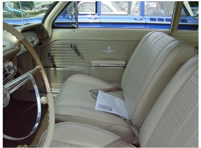
04C Fawn Interior