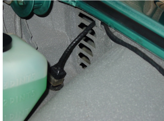
Left Rear Trunk Corner – 09c 1964