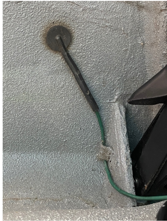
04A Horn Wire clip

12A Blower Belt Guides: All Corvair engines produced after November 29, 1963 were equipped with Blower Belt Guides, as noted in Technical Service Bulletin #982, dated March 18, 1962. NOTE: AC engines with the condenser mounted over the blower (1964-65) never used the upper belt guide as it would've interfered with the condenser shroud; however, AC engines built after 11/29/1963 would've had an upper shroud with mounting point for the guide – the holes would've been plugged with the normal guide bolts.