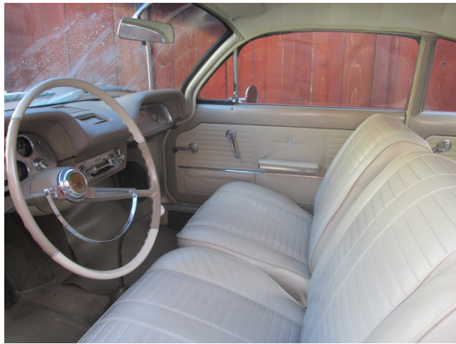
10C Fawn Interior

01A? Fawn Interior (Fisher interior Paint code F): The exact date or reason for the change is not precisely known, nor is it documented in any literature we've found, but it appears that all cars with Fawn interiors built in the first part of the model year (so far up through 11D) use Medium Fawn paint to trim the doors and rear quarters, whereas all cars from 01A onwards use Light Fawn to trim those area