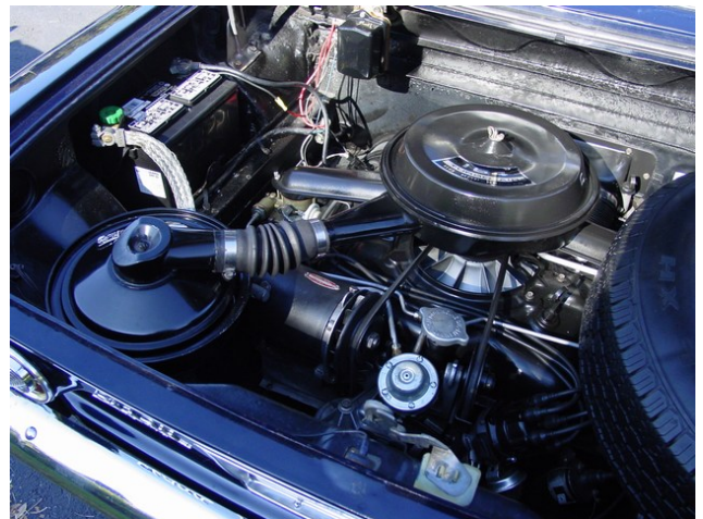
05C Oil Bath Pre-Cleaner