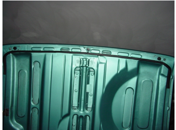
04A Deck Lid with 2 drain holes and longer weatherstrip

02C? Vented Battery caps These were added right around the same time as the Deck Lid modifications, to eliminate possibility of battery acid fumes being drawn into the heater system. Cars with this modification can be identified by the presence of the small oval hole in the right rear wall of the battery box (for the hoses). As with the deck lid changes, there is some variability in the date codes: the earliest code with the hole is 02C, whereas the latest without the hole is 02D