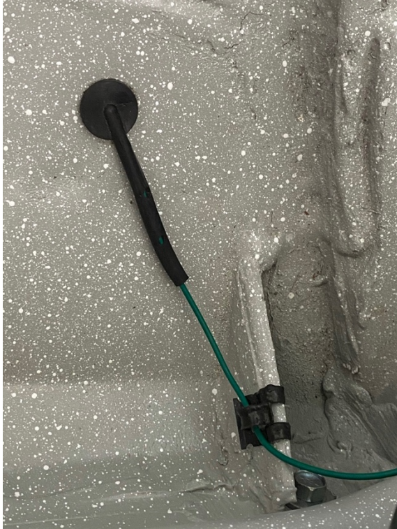
09C Horn wire clip

At the beginning of the model year a separate clip held the horn wire to the body seam in the trunk floor; later on the clip was changed to a welded tab that could be bent over the wire: