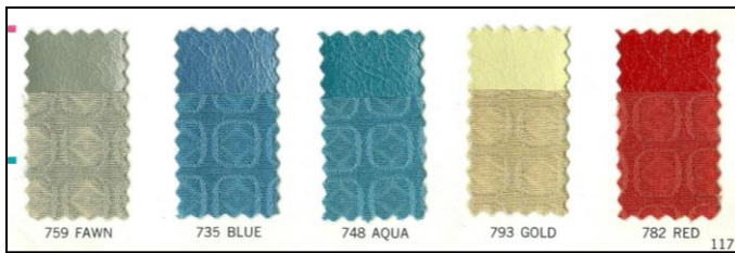
Above: 1962 Monza cloth upholstery samples.

Below are scans of actual upholstery samples of the 1961 and 1962 Monza cloth bench seat interiors from the Dealer Albums, courtesy of Dave Newell.