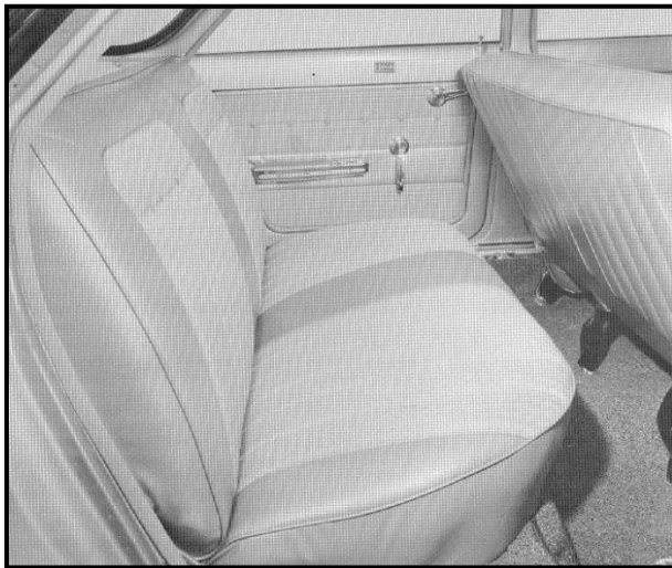
'62 Sedan rear seat with colored buttons.