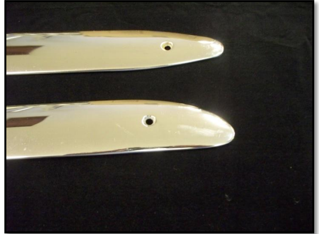
Upper end of trim. Bucket seat on top and bench seat on bottom.