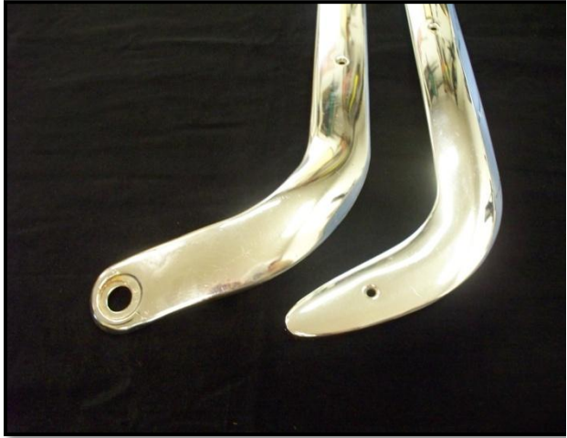
Lower end of trim. Bucket seat on left and bench seat on right