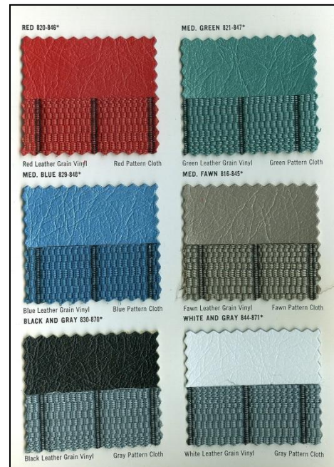
Right: 1961 Monza cloth upholstery samples.