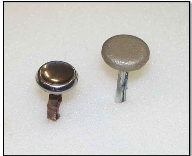
Stainless button (left) and colored button (right)