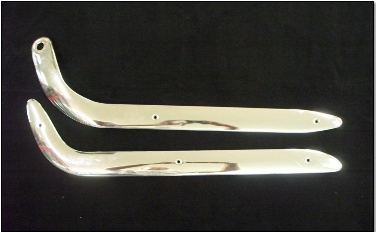
Above: Top trim is for buckets seats. Lower trim is for bench seats.

This trim is similar to that used on bucket seats, except that since the bench seats don't fold forward, the trim did not need a big hole for the seat pivot or to cover a hinge at the bottom. So the bottom of the bench seat trim was shaped differently than the bucket seat trim. In addition, the top of the bench seat trim was shaped differently. This trim was held in place by three typical chrome upholstery screws, which attached into three special clips that were screwed to each end of the seat frame. Pictures showing this '62 Monza bench seat side trim are shown below and on the next page, along with a bucket seat side trim for comparison.